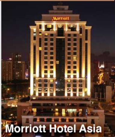
Marriott Hotel Asia