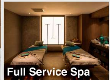
Full Service Spa