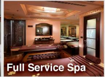
Full Service Spa